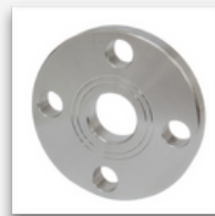
Cold or hot transformed parts