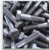
Heat treated parts