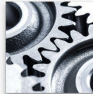
Heat treated parts