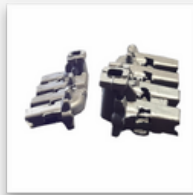
Flat and very complex